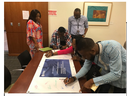
USAID staff in Nigeria sign on to pledge their commitment to preventing sexual exploitation and abuse in an AAPSM event.