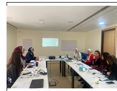
Joint planning meeting by Gender COPR.