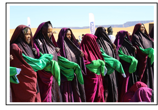
"A group of women perform a tribal tribute dance for guests at the Ghat festival. Ghat is located deep in the Sahara desert, on the southwest boarder of Libya, near Algeria. Before the 2011 conflict, it was once a thriving tourist town, known for some of the most stunning desert dunes and cave drawings in the world".