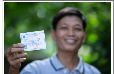
HIV Patient Receiving their SHI Card